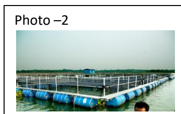
Over View of 20 Battery Cages.