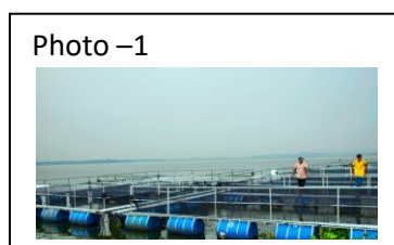
Over View of 20 Battery Cages.